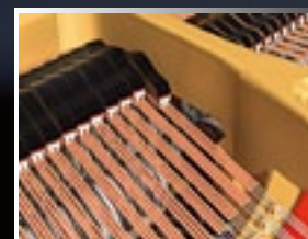
■ All-copper-wrapped strings with three strings per key

The V-Piano's Vanguard piano model takes the instrument to new levels of creativity. Imagine a piano with three strings for every key, even in the low register, with all strings wrapped in copper material or perhaps made of steel. Tones that were previously unavailable are now at your fingertips, with smooth, fluid performance across every note. Thunderously deep and smooth low notes can also be achieved, thanks to all-triple-string programming. With the V-Piano, you can set the piano-voicing parameters individually for each register, enabling gorgeous sounds, textures, and resonances that have never been heard before.