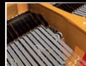
■ All-silver-wrapped strings with three strings per key

Offering all-silver-wrapped strings as a user-selectable choice, the V-Piano Vanguard model lets you express yourself in bold new ways. Since silver strings are physically softer and heavier than copper, the Vanguard model provides oversized, extra-hard virtual hammers to compensate. Only the V-Piano is capable of bringing this type of dream piano to life, with unprecedented sustain and shimmer. It's also possible to change tonality in real time via footpedal, which can be mapped to parameters such as cross resonance for controlling the hardness of the strings. Tuning is completely customizable as well.