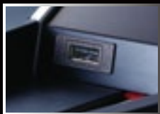
Image Synchronization Support With V-LINK

The V-Piano is equipped with a USB memory port that lets you play back audio files stored on USB memory devices. In addition, SMF data can be brought to life using the V-Piano's onboard General MIDI 2 sound generator.