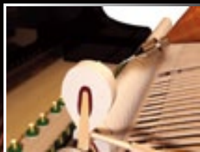
■ Adjust the hardness of the hammer