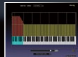
■ Editor screen: Adjust the pitch for specific key area zones

Offering all-silver-wrapped strings as a user-selectable choice, the V-Piano Vanguard model lets you express yourself in bold new ways. Since silver strings are physically softer and heavier than copper, the Vanguard model provides oversized, extra-hard virtual hammers to compensate. Only the V-Piano is capable of bringing this type of dream piano to life, with unprecedented sustain and shimmer. It's also possible to change tonality in real time via footpedal, which can be mapped to parameters such as cross resonance for controlling the hardness of the strings. Tuning is completely customizable as well.