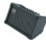
CUBE Street Stereo Amplifier