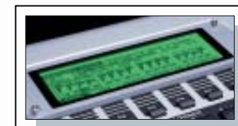
The Fantom-Xa's 240 x 64 backlit LCD provides friendly, icon-based communication.

Under the Fantom-Xa's hood is one of the most powerful synth engines on the market. It's loaded with great raw waveforms, semi-modular structures, multiple filter types, and up to eight syncable LFOs per patch, including the Fantom's user-programmable Step LFO, which you'll find highlighted in the Pulsating and Beats&Groove categories. Use the onboard rhythms to launch a breakbeat from the pads, then press the Category Lock button to surf through dozens of perfectly