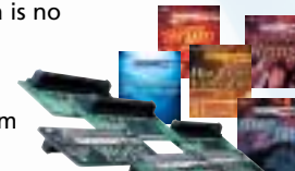
SRX-Series WAVE EXPANSION BOARDS

Many of the attributes that make the flagship Fantom-X series so popular have been ported to the Fantom-Xa. Check out these mouth-watering specs: 128-voice polyphony, up to 644MB expandability, Skip Back Sampling, high-resolution built-in sequencer, realtime audio time-stretching, COSM® modeling effects, mastering processor, USB port, WAV/AIF compatibility, and an SRX expansion slot. The Fantom-X's sequencer has the largest capacity in the industry, and the Fantom-Xa is no different. It's always waiting for you to start recording — just press the Record button from any mode and you're off.