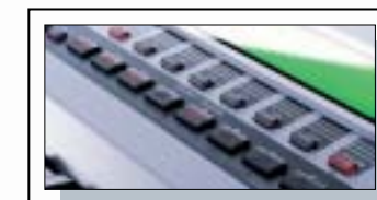
Instantly select sequencer tracks and synth layers with the push of a button.