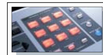
The Fantom-Xa's Pad bank can trigger sounds and phrases, and can also double as a numeric keypad.