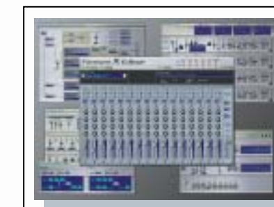
The Fantom-X editor for Mac and PC allows full-scale computer control via simple USB connection. A free copy is supplied with every Fantom-Xa.

sync'd rhythms for instant dance-floor inspiration. Enable the Xa's arpeggiator (choose from over 100 programmable patterns) and warp it with the twist of a knob.