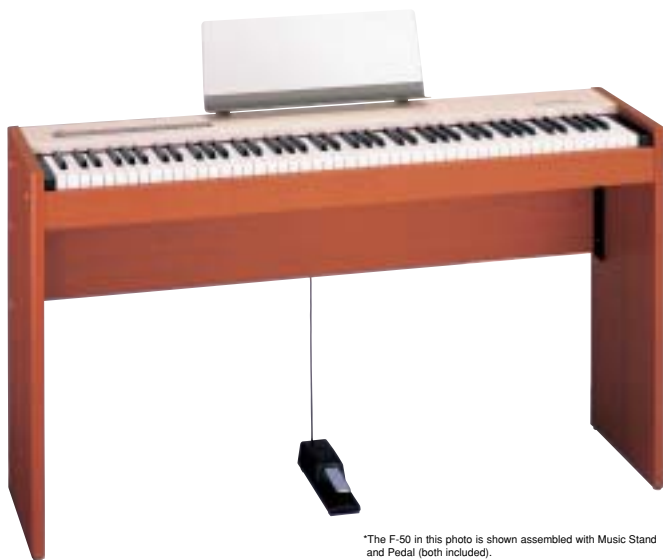
*The F-50 in this photo is shown assembled with Music Stand and Pedal (both included).

The F-50 offers features that make learning to play the piano more fun and effective. Its 65 internal songs include many classical favorites that are a pleasure to listen to. There are also five special songs designed to familiarize you with specific instrument tones, such as piano, harpsichord and organ. The built-in Song Recorder is a great way to check your progress. You can record one hand and then focus on practicing the other while it plays back. The F-50 is an ideal "first piano" for children or adults.